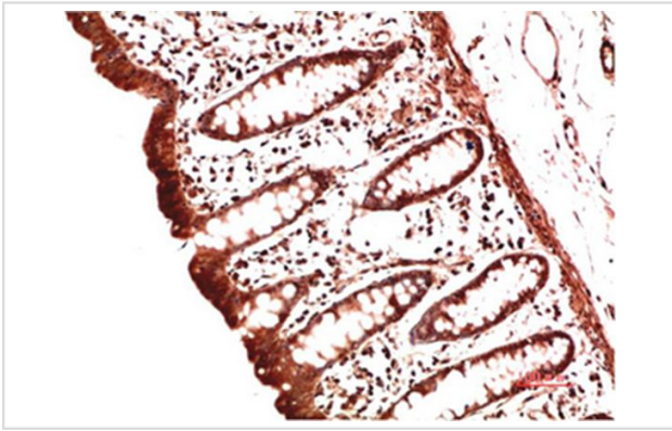
Immunohistochemical analysis of paraffin-embedded Human Colon Carcinoma Tissue using Collagen II Mouse mAb diluted at 1:200