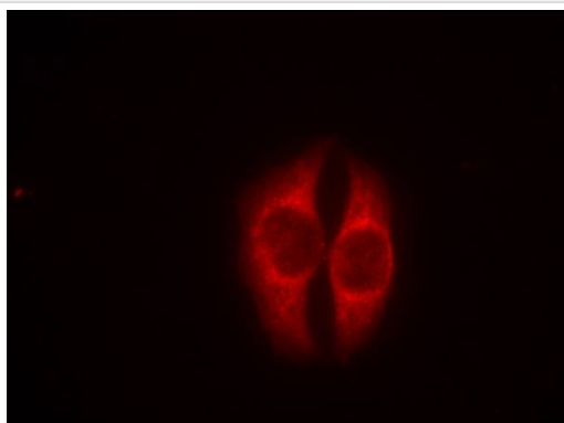
Immunofluorescence staining of methanol-fixed HeLa cells using p53(Phospho-Ser37) Antibody #AB11098.