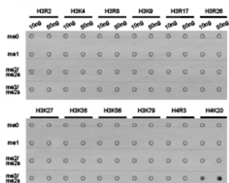
Dot-blot analysis of all sorts of methylation peptides using H4K20me3 antibody.